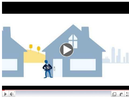
What is NFC?

We recently released a new educational NFC Video. Watch this video to get inspiration for new NFC products and apps. Share this video to help spread the wonders of NFC. We encourage you to post the video on your social media channels and embed it in your blog.