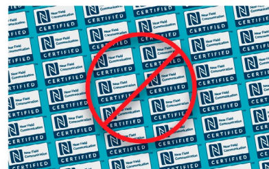
Figure 5: Certification Mark in a Tile Pattern