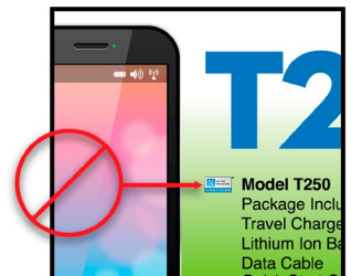
Figure 7: Certification Mark Too Small to be Legible