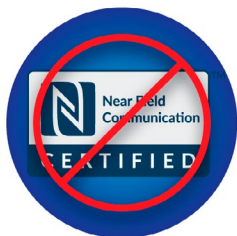
Figure 4: Certification Mark Inside a Circle