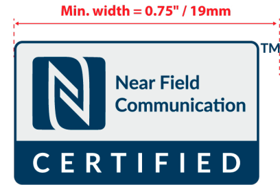
Figure 8: Minimum Logo Size

Do not integrate the Certification Mark in any company-specific or other proprietary mark or logo in a manner that creates the overall impression of a single, unitary mark (see Figure 9).