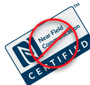
Figure 6: Certification Mark Rotated on its Axis