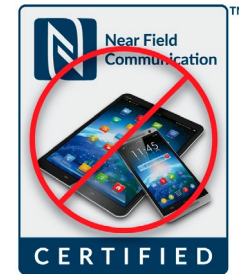
Figure 2: Certification Mark Broken Apart

Examples of inappropriate uses of the Certification Mark include, but are not limited to, the following graphics.