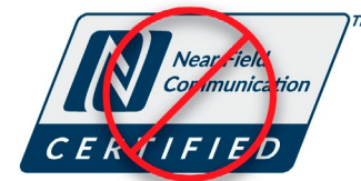
Figure 3: Certification Mark Skewed or Altered