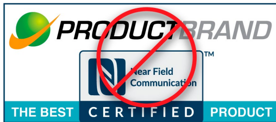
Figure 9: Certification Mark Incorporated Incorrectly into Another Logo