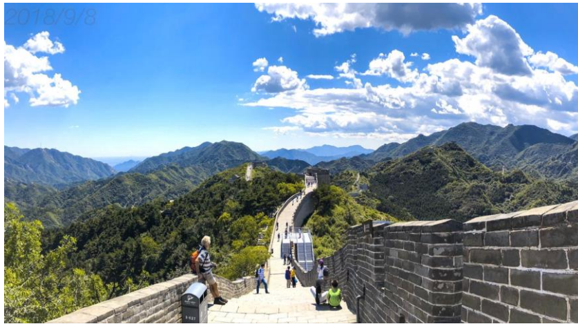
The Great Wall

The Great Wall, located in northern China, is 6,700 kilometers long and known as the “10,000-li Great Wall”. Construction of the wall went on for more than 2,000 years, from 7th century BC to the 17th century AD. The wall has become a symbol of both China’s proud history and its present strength.